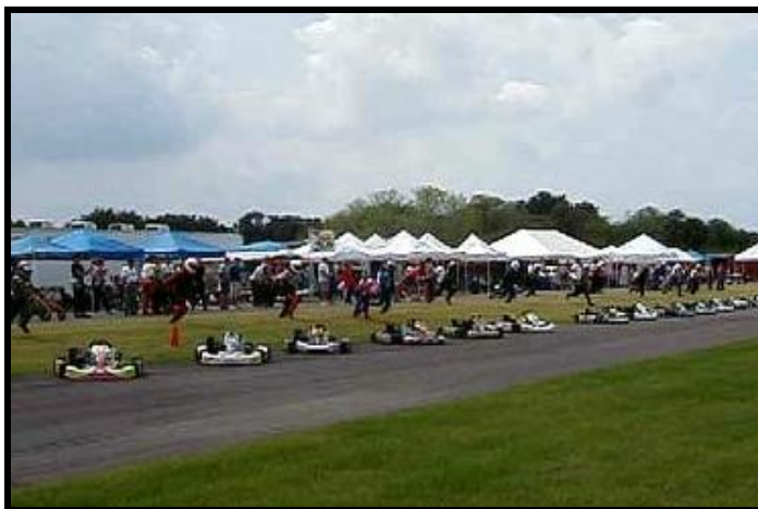
Primus Enduro Pic