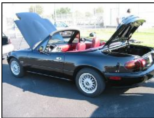
Various shots from last Auto Cross - taken by Billy Young