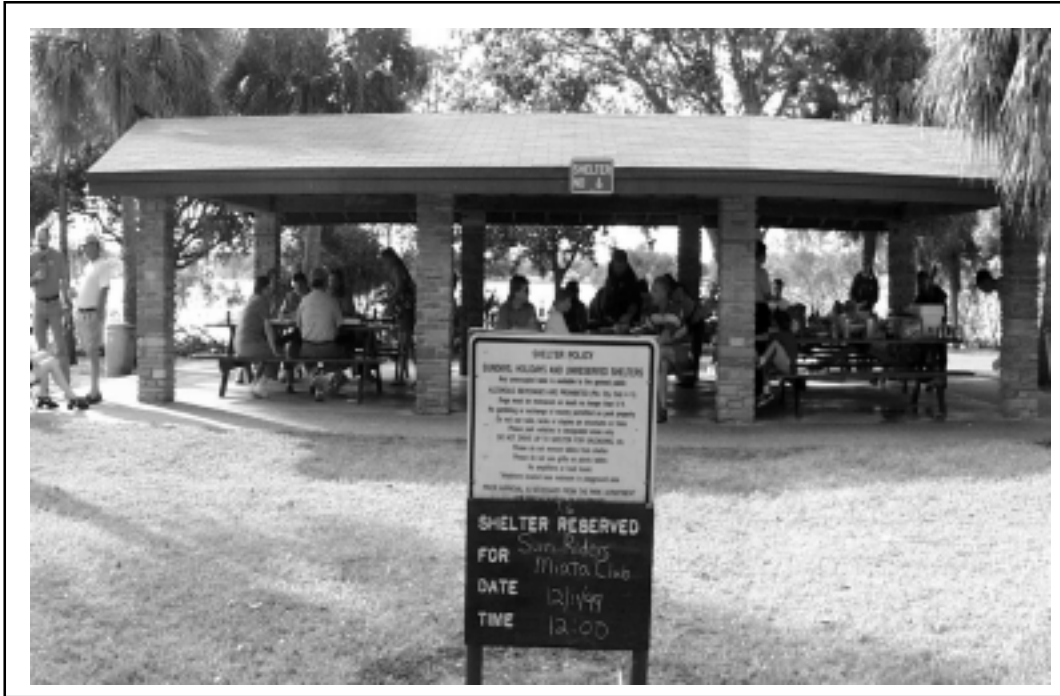
Holiday Picnic, December 1999, Lake Seminole Park