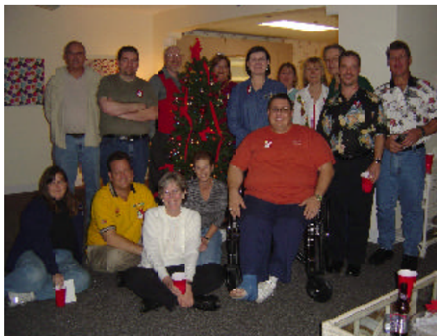
2004 Christmas Party at the Chart House Suites, Clearwater Beach.

As I write this, the party is over but I reflect on the fun and memories and want to say thanks to all the SunRiders who make this club so special. Have a wonderful and warm 2005!