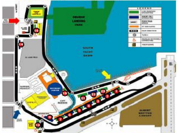
2003 Grand Prix Of St. Petersburg Circuit Map

To Order Call 1-888-34-SPEED and mention Code #CC0111 or fax this order form to: 1-727-898-7223