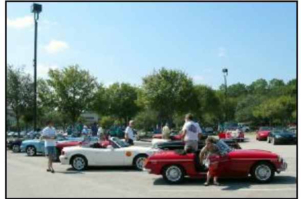
Arriving: Cars arrive at the end of the rallye