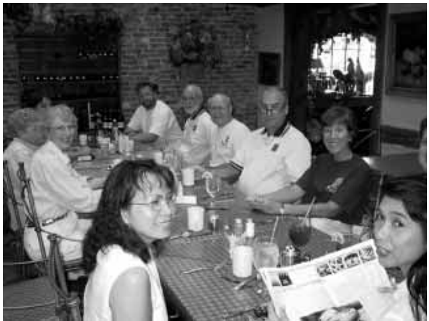
Sun Rider's Members enjoying Breakfast Club at the French Hen. Good food, good friends, and a little Miata drive. Come to these "mini-events" to meet your fellow members (and have a great breakfast!)

It is available at most news stands, Publix, Kash n' Karry, and Winn-Dixie stores. Besides the stuff on our Club, there are some interesting stories in it (a MUV con-